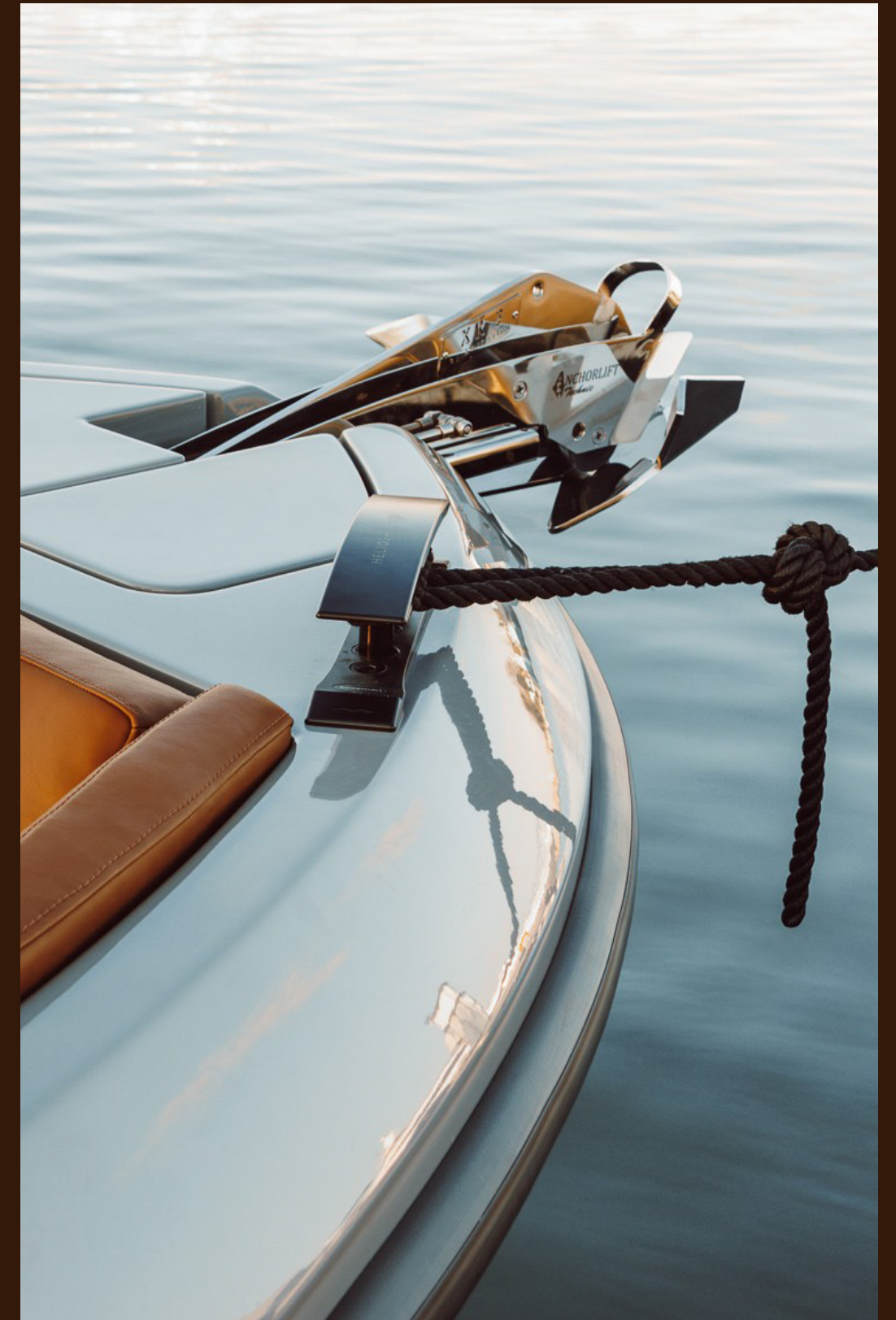
Stainless steel automatic anchor*