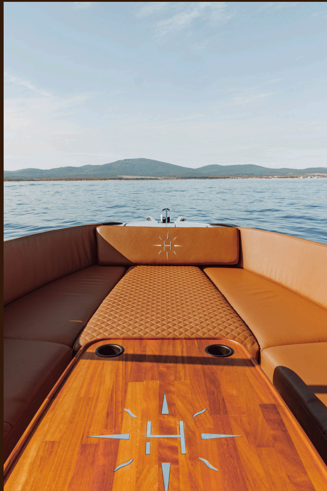
Clean design & UV resistant marine fabric Exotic wood table with 4 cup holders