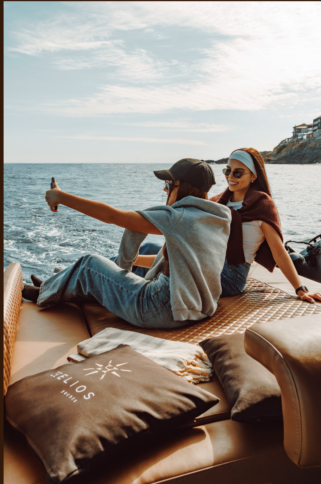
Large sunbed to enjoy the view