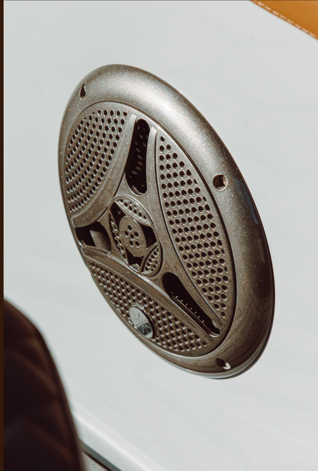
2 built in Bluetooth speakers