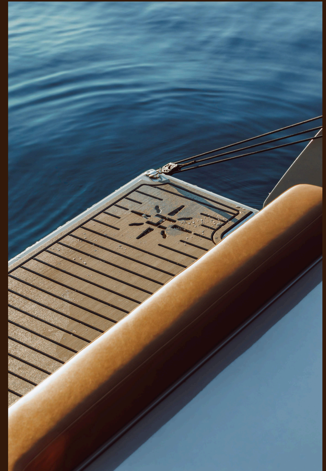
Retractable stern swim platform